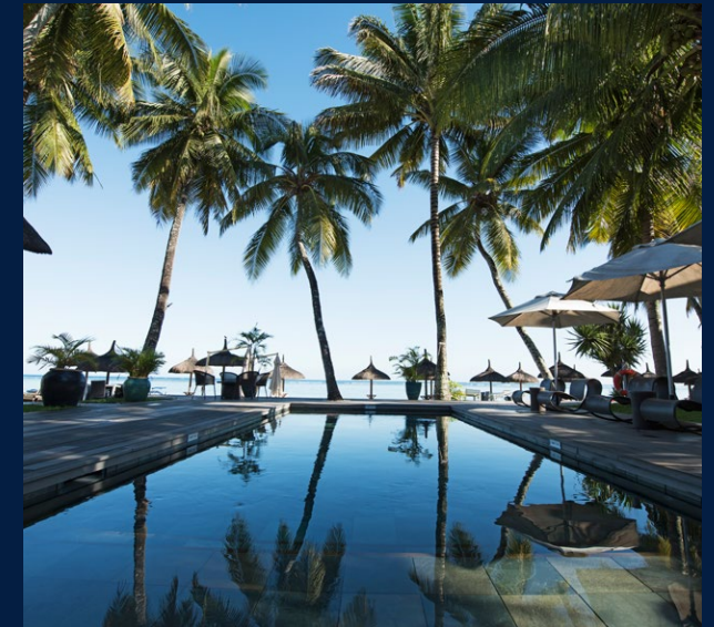
Sakoa Boutik Hotel