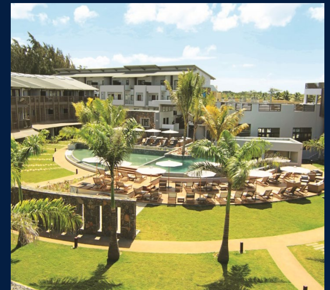
Be Cosy Apart' Hotel