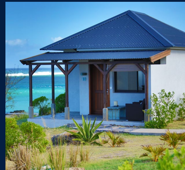
Tekoma Boutik Hotel