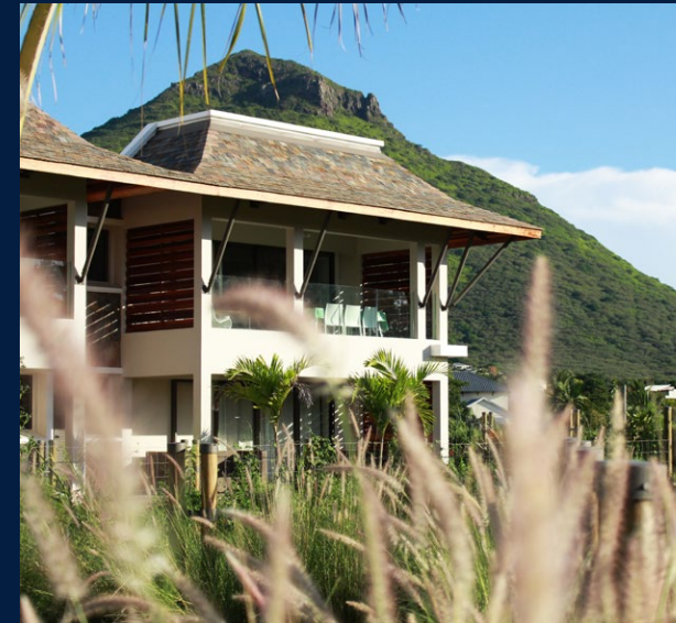
Les Terrasses du Barachois

* All photos, plans and information contained in this document are not contractual. The promoter reserves the right to modify this information without notice.